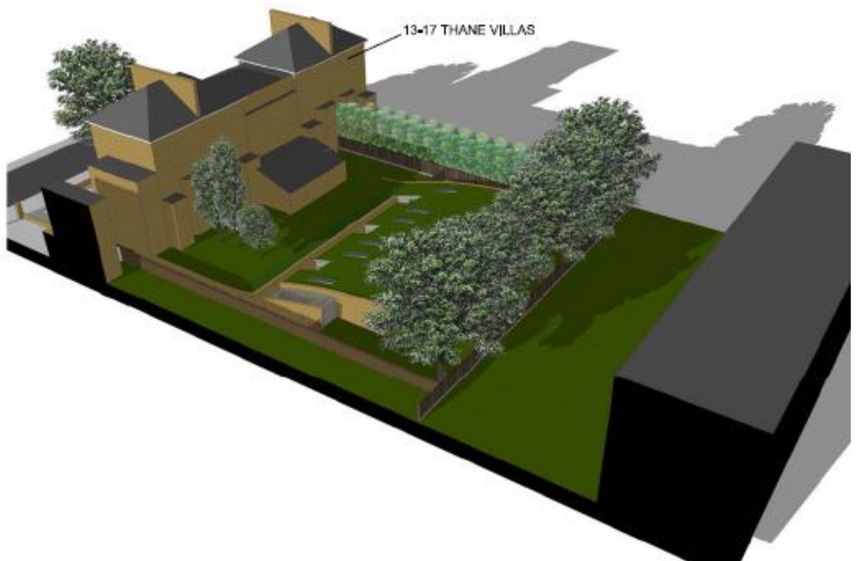
Image 7: 3D model of proposed development in the context of surrounding dwellings.