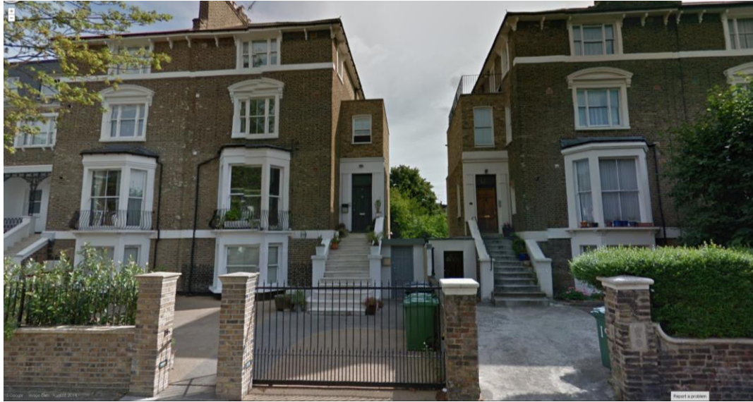
Image 2: Front of 17 Thane Villas – access to the proposed development through existing side gate adjacent to common boundary with No.19 Thane Villas