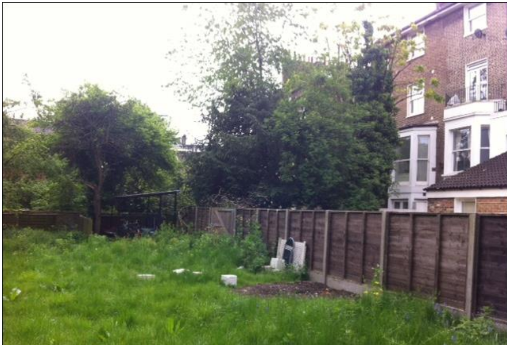
Image 5: Application site with boundary fence subdividing plot with rear garden of Nos.13-19 Thane Villas